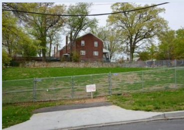
3401 13 th Street SE

A “Pre-Bid: Q&A Session” will be held at 10:00 am on Wednesday, June 22, 2016 at DHCD’s Housing Resource Center, 1800 Martin Luther King Jr. Ave. SE. The deadline for submitting proposal applications is 4 p.m., Thursday, September 1, 2016.