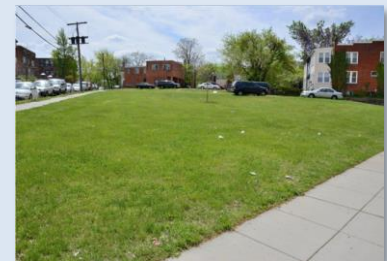
Minnesota Avenue and 27 th Street SE

For additional updates, information and questions, please go to our website http://dhcd.dc.gov/service/property-acquisition-and-disposition or contact padd.sfo@dc.gov .