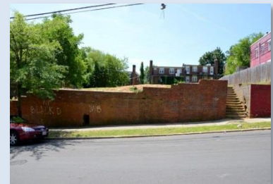
62-64 Forrester Street SW