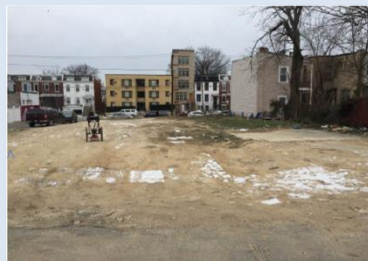
809-813 Kennedy Street NW