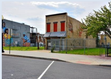
Florida Avenue and Q Street NW