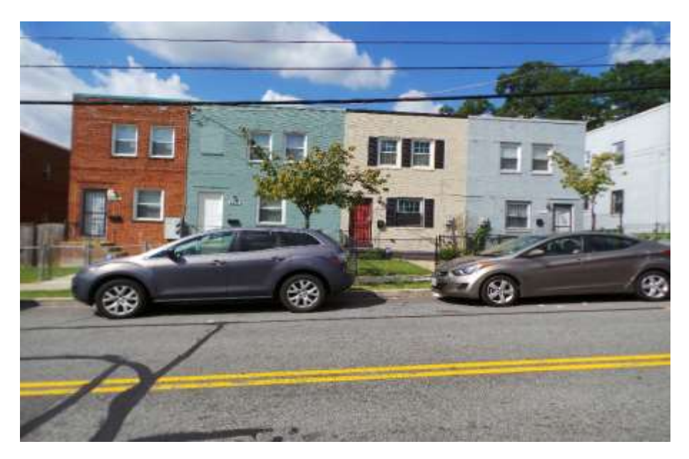
View of Adjacent Properties at 4245, 4249, 4251 and 4259 6^{\rm th}\,{\rm St}, SE