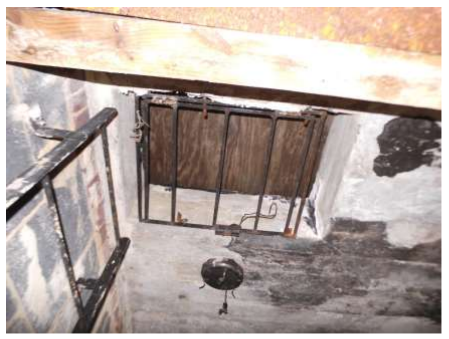
Trap Door and Ladder to Roof from Second Floor