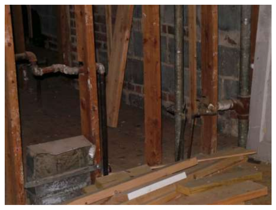
Pipes in Kitchen Area