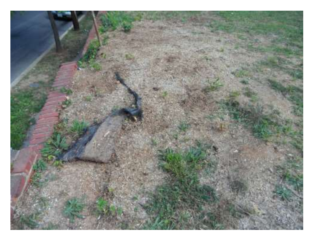
Dead grass at 62 Forrester St