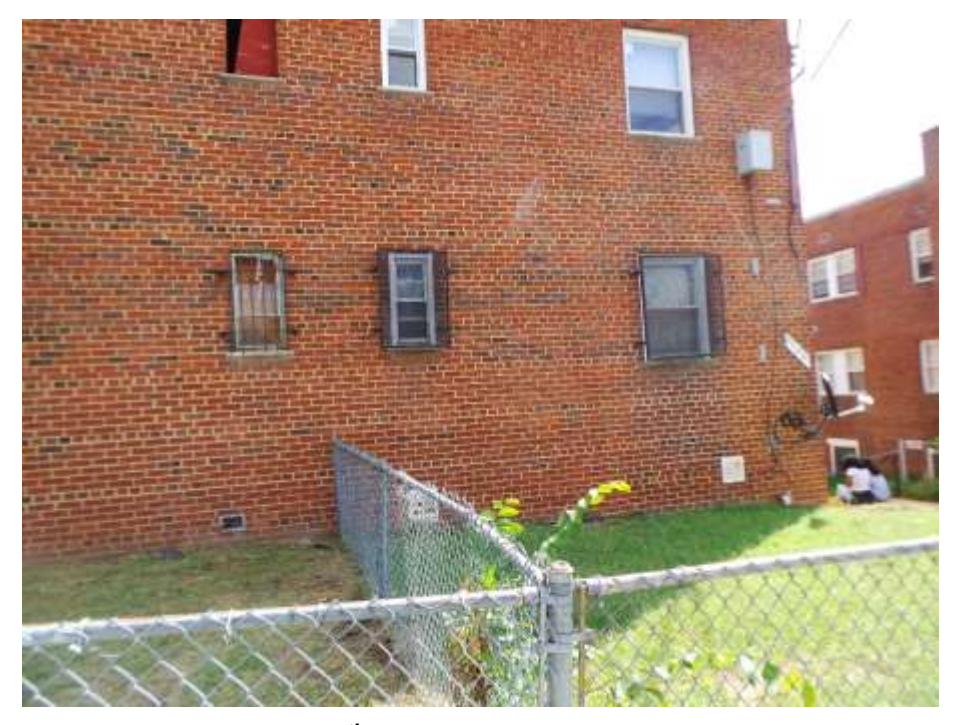
Side View of 4246 6<sup>th</sup> St, SE and Lot Line Divide between 4244 and 4246 6<sup>th</sup> St, SE