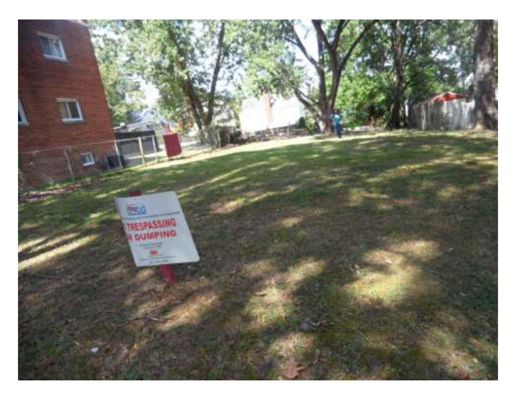
157 Forrester St. from the site (Looking North)