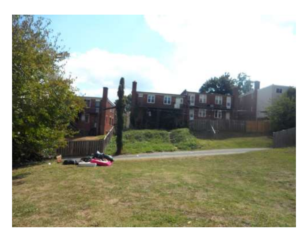
62-64 Forrester St. from the site (Looking North)