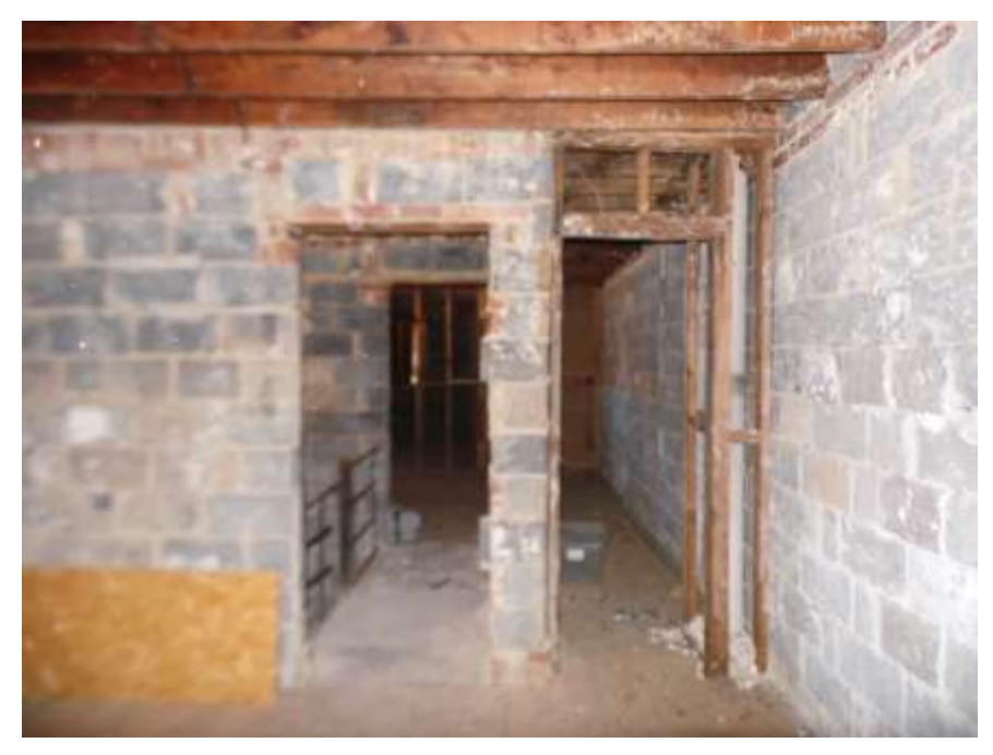
Entrance to Reisdential Unit and Hallway between Units