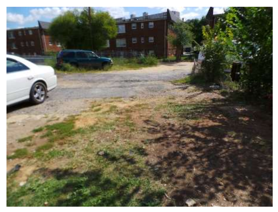
View of Paved Alley looking North