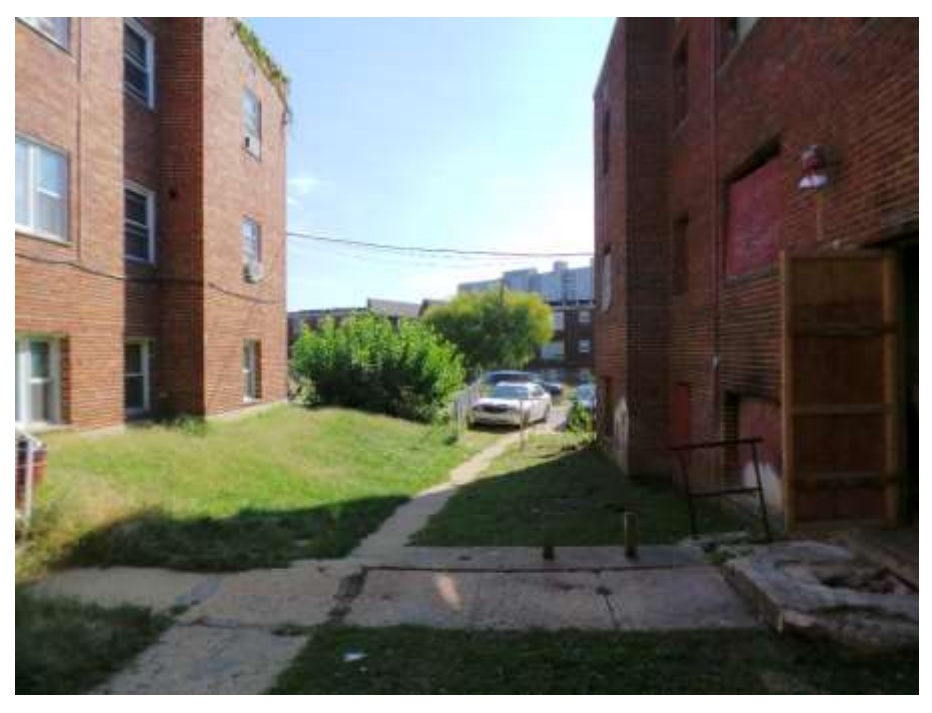
View of Subject Property looking North