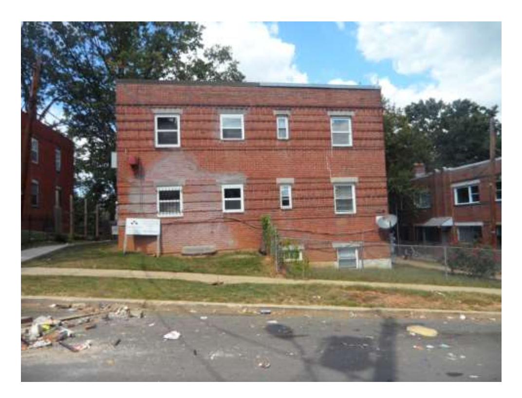
Demolition or Renovation work across the street from 62-64 Forrester St