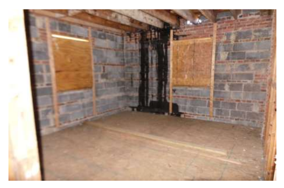
Roof Tar on Wall in Residential Unit on Second Floor