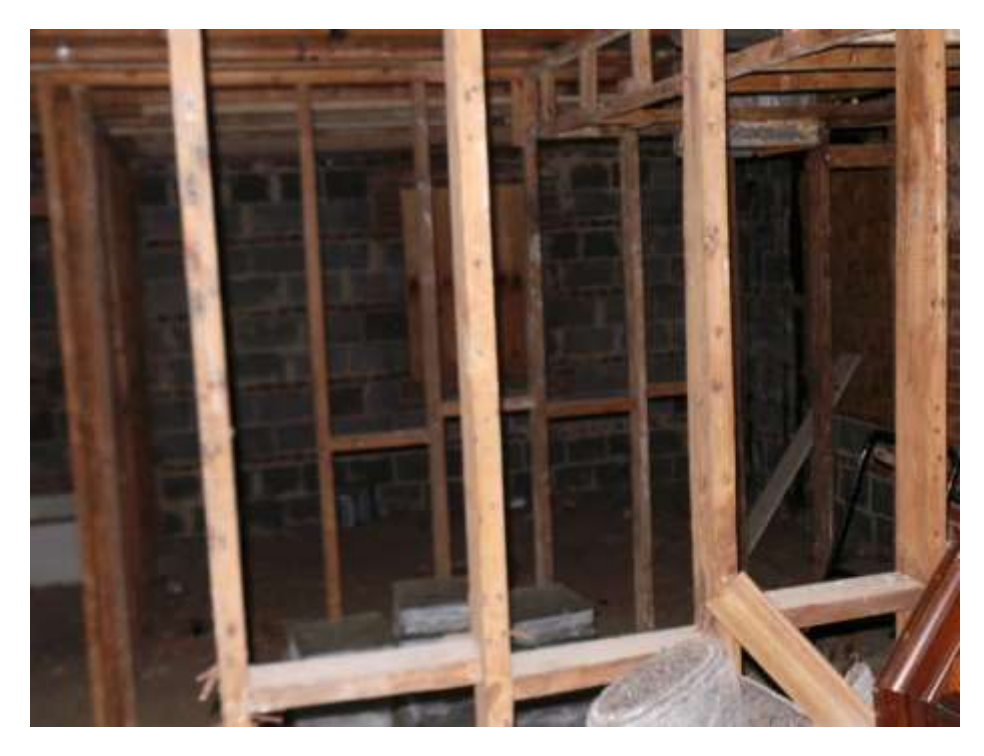
Wooden Partioning of Each Units Into Living, Kitchen and Bedroom Areas