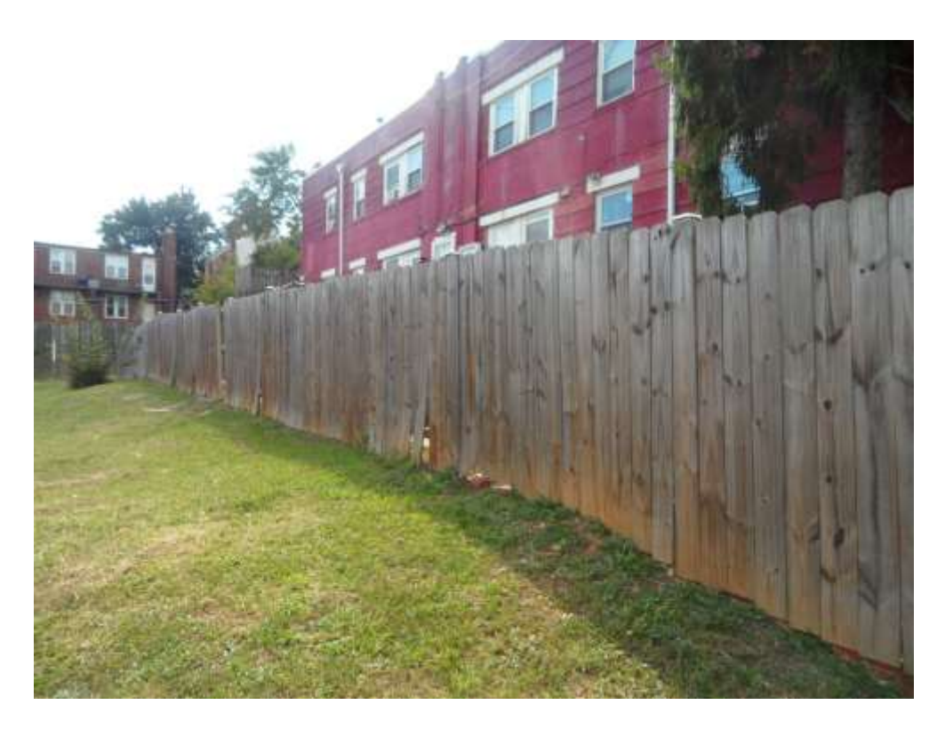
62-64 Forrester St. from the site (Looking West, Southwest)