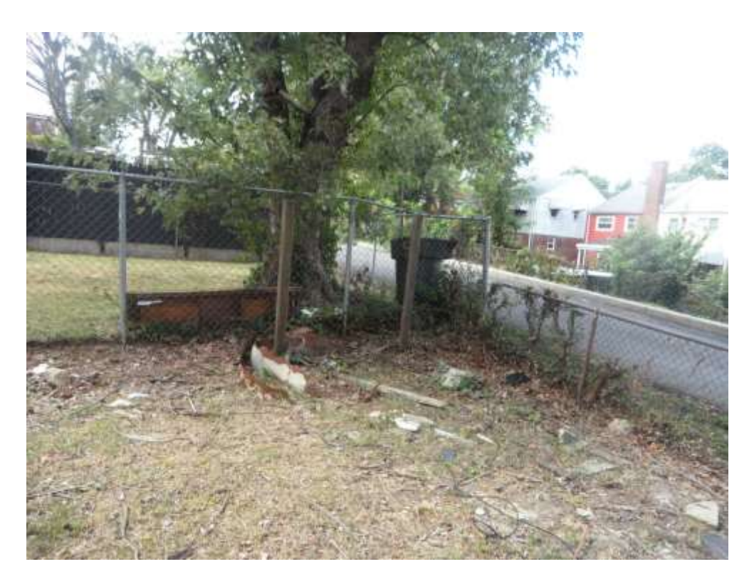
NW corner of 157 Forrester St with some metal and demolition remnant