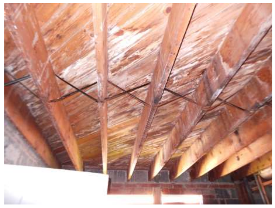
Wooden Ceiling in Residential Unit