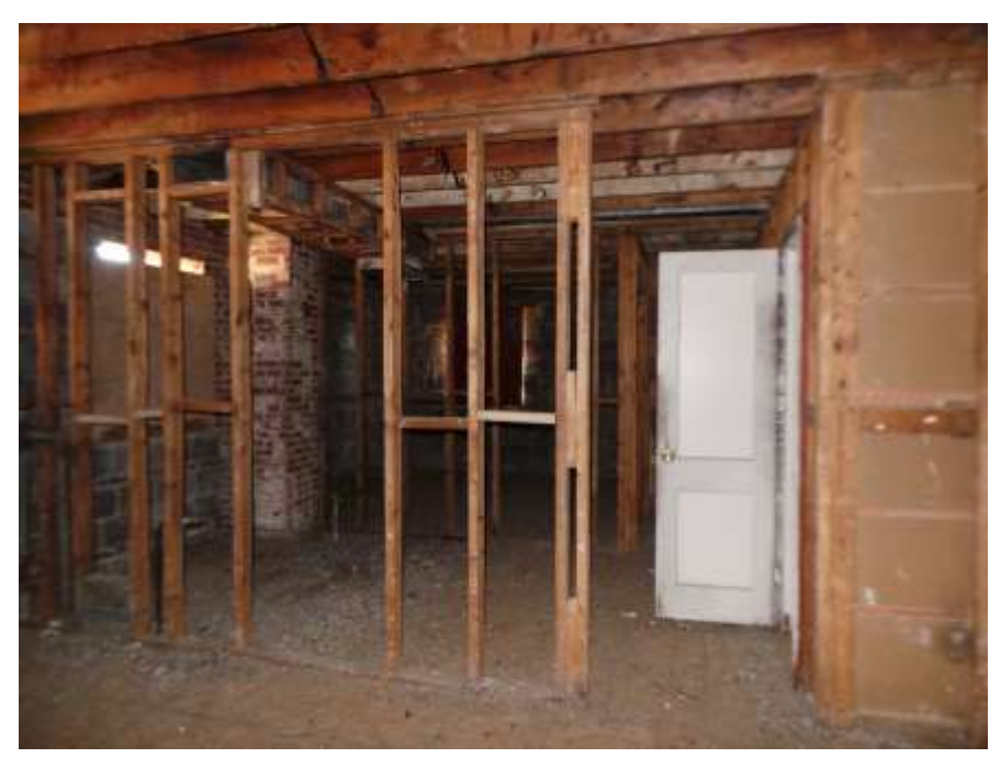
Overview of Residential Unit on Second Floor