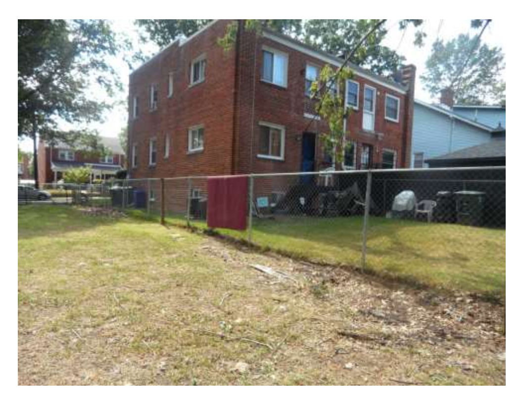
Fence between 161 and 157 Forrester St