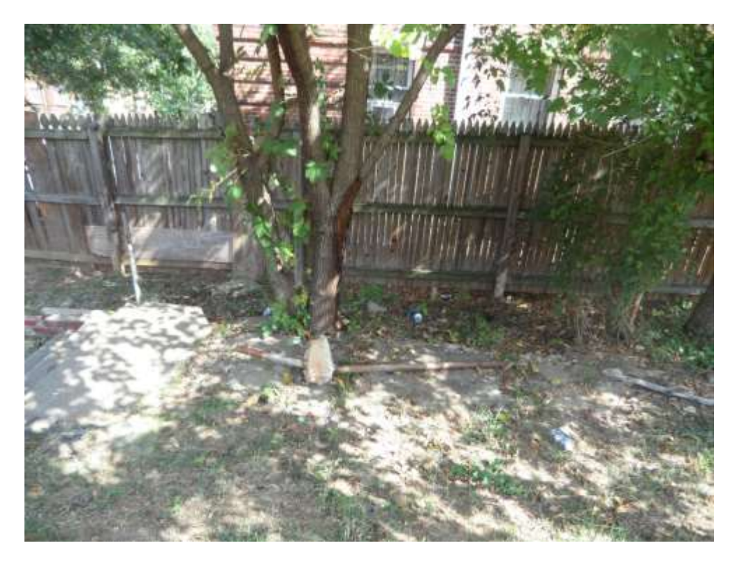
Remnant of Paved Walkway at 62 Forrester St