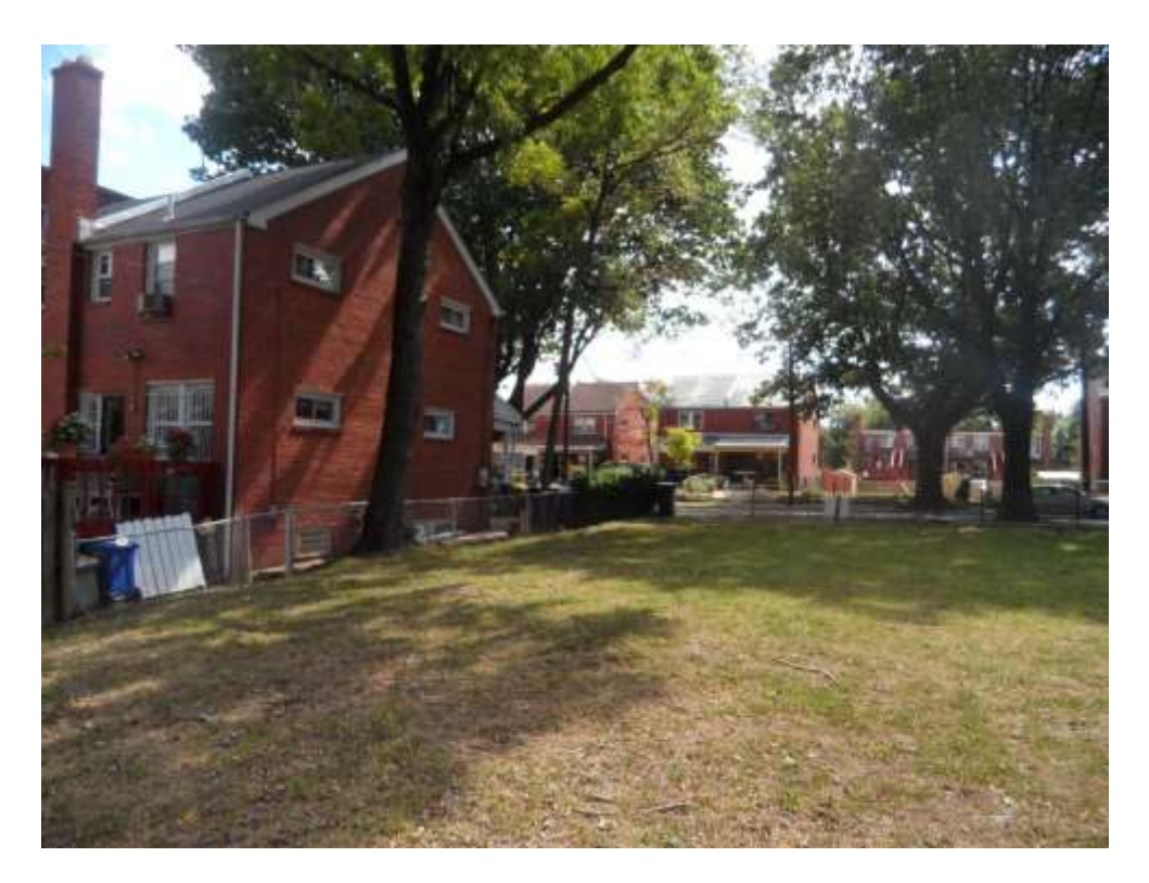
157 Forrester St. from the site (Looking South)