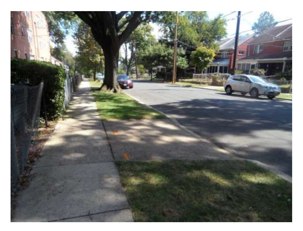
Curb cut to 157 Forrester St. (Street End)