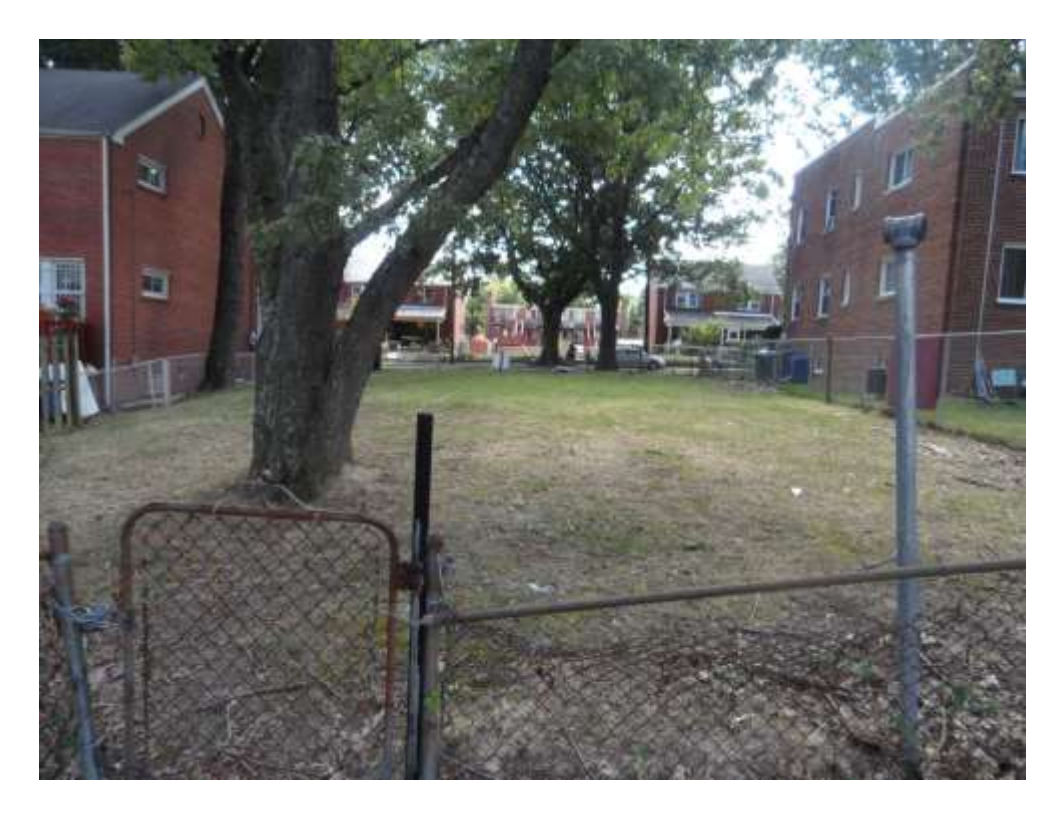
157 Forrester St. from the Alley (Looking South)