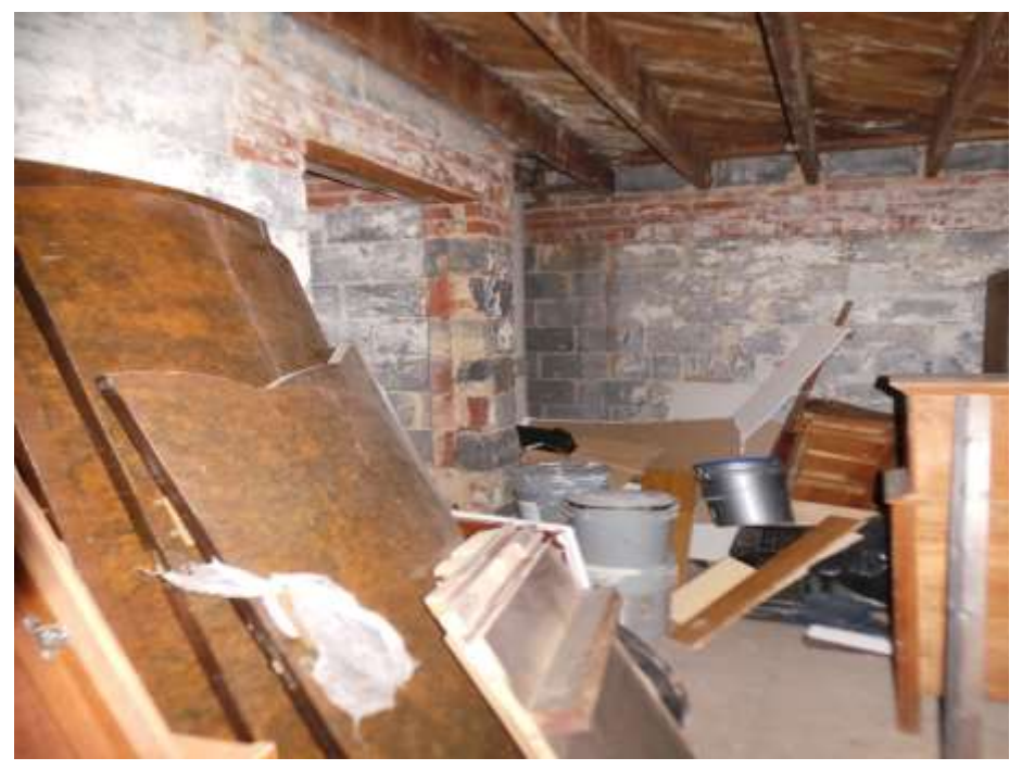
Storage in Residential Unit on the First Floor