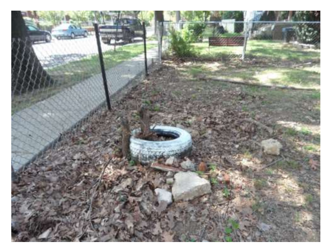
Tire, demolition remnant and tree stump at 157 Forrester St. (Street End)