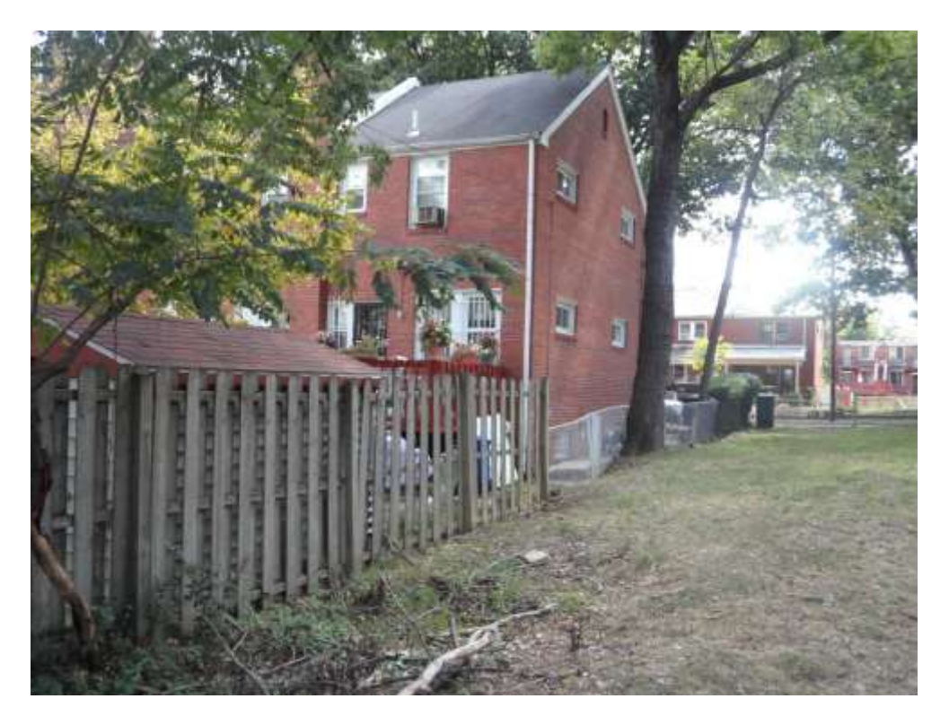
Fence between 151 and 157 Forrester St