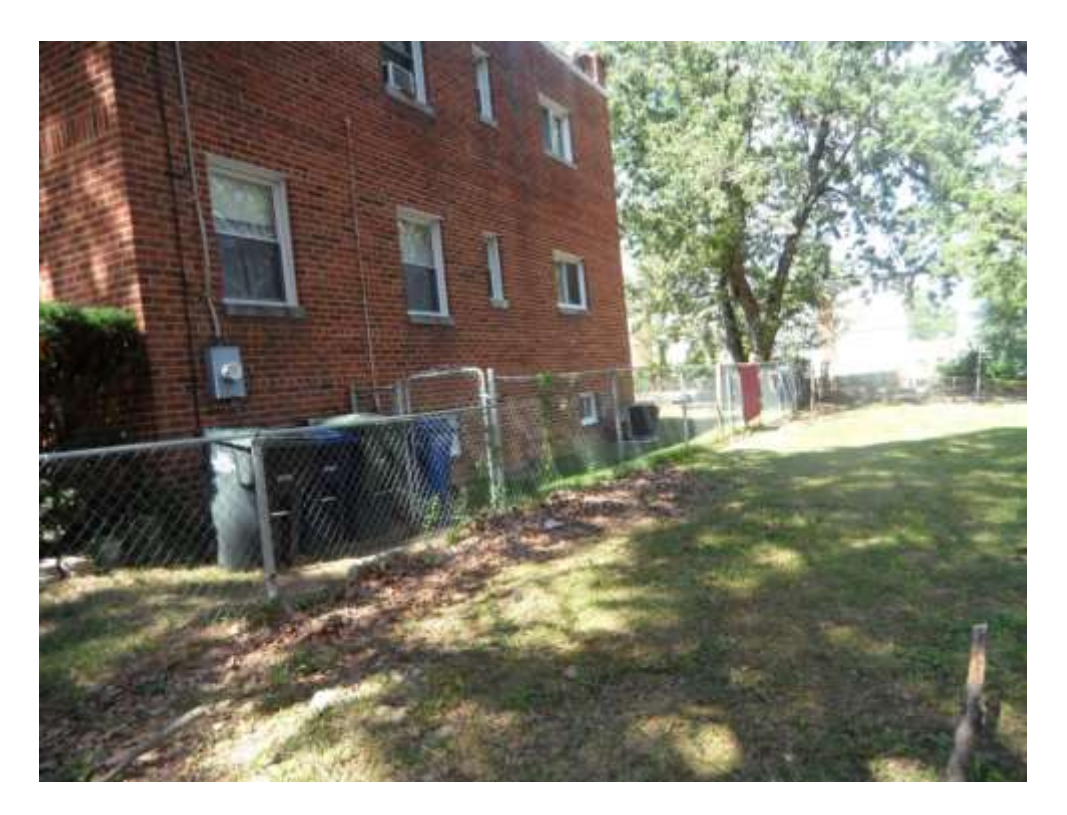
Fence between 161 and 157 Forrester St