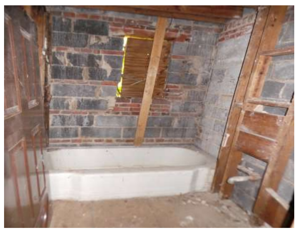
Bath Tub in Rear of Residential Unit