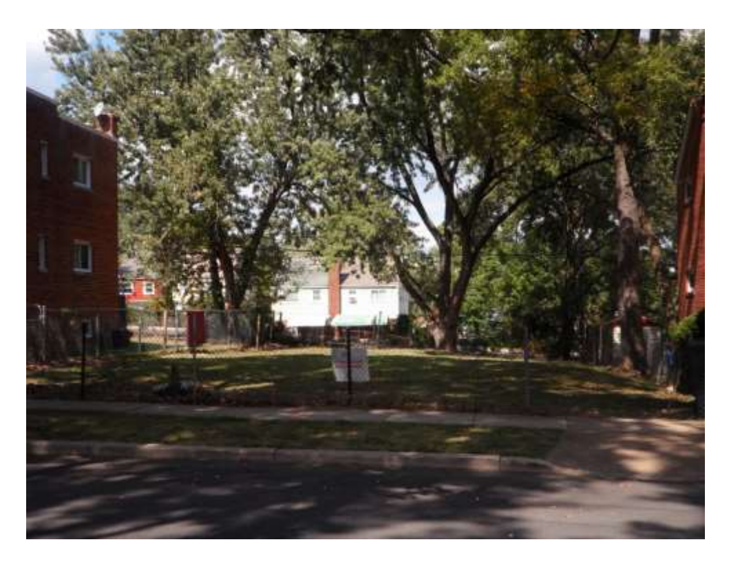
157 Forrester St. from the Street (Looking North)