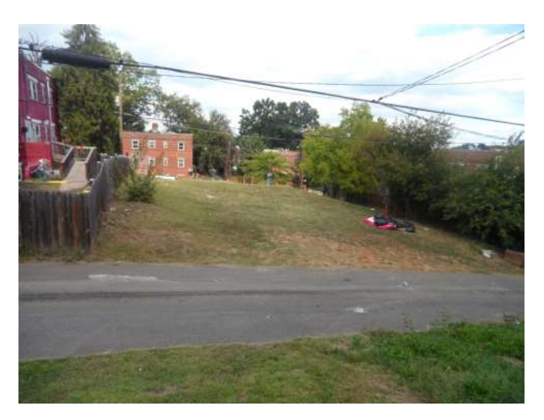
62-64 Forrester St. from the Alley (Looking North)