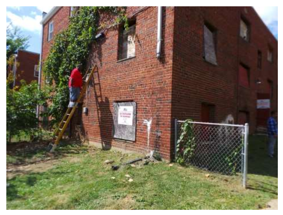
Side View of Subject Property looking Southeast