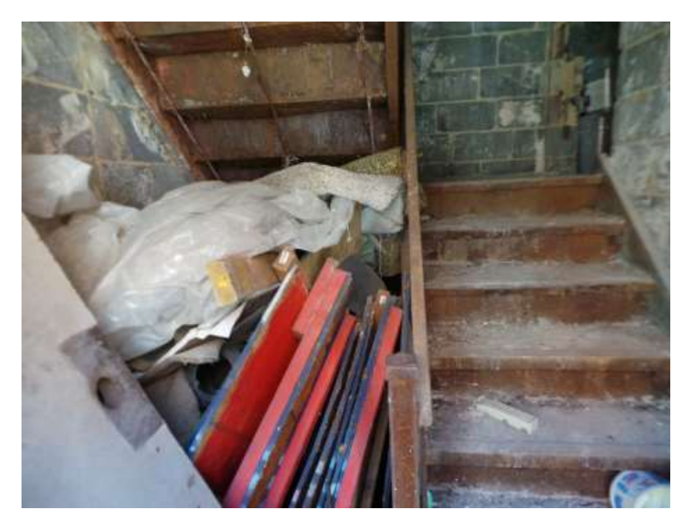
Stairway to the Basement and Residential Units