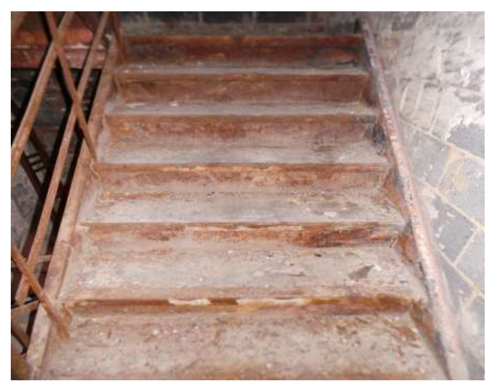
Rusty Stairway in Building