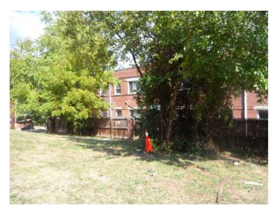
62-64 Forrester St. from the site (Looking East, Northeast)