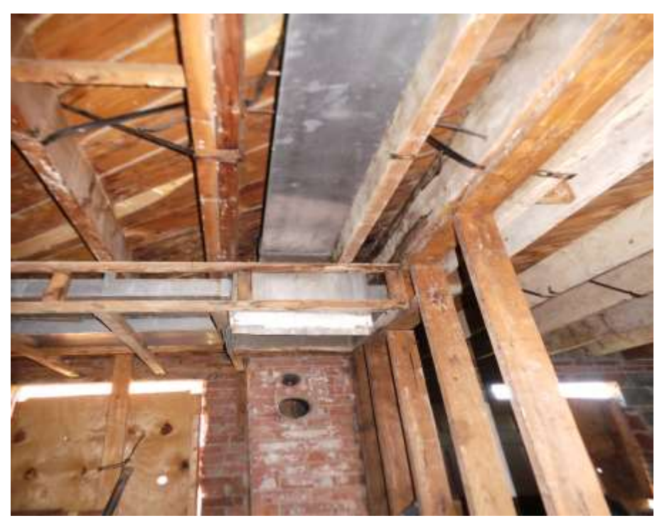
Ductwork and Wooden Ceiling in Kitchen Area