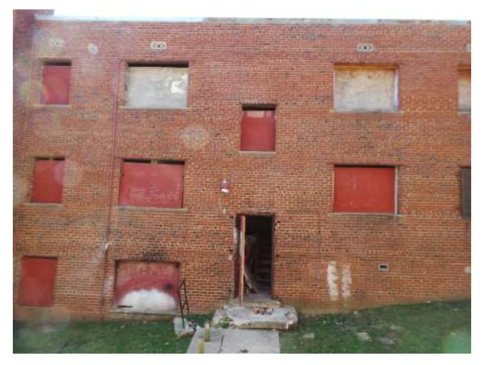
Overview of Subject Property