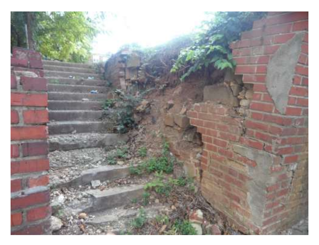
Stairs to 62 Forrester St from the Street