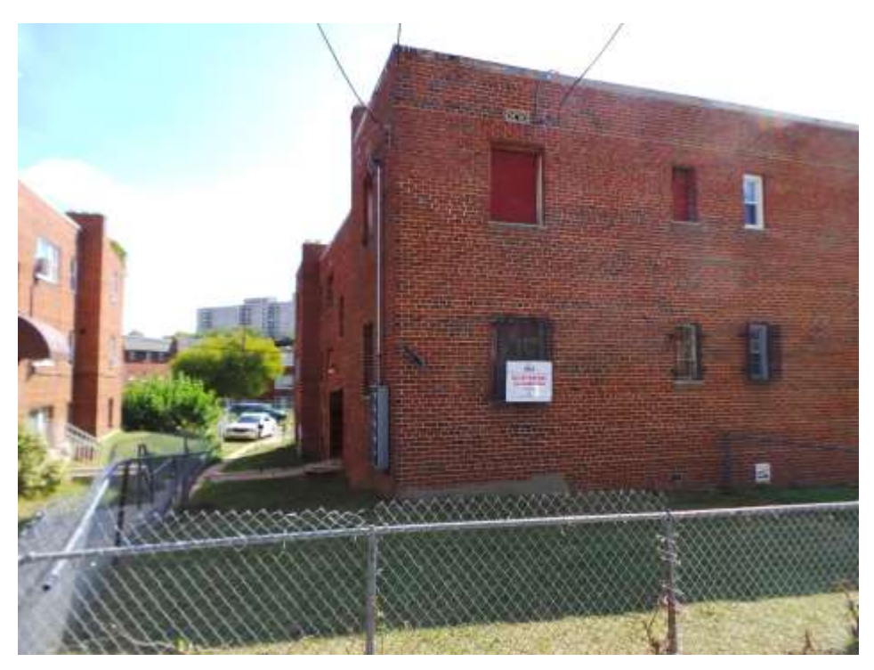
View of Subject Property looking Northeast