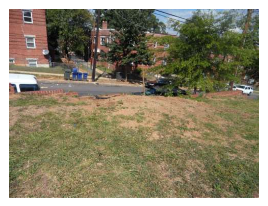
62-64 Forrester St. from the site (Looking North)