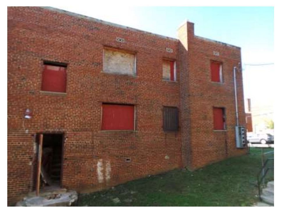
View of Subject Property looking Southeast