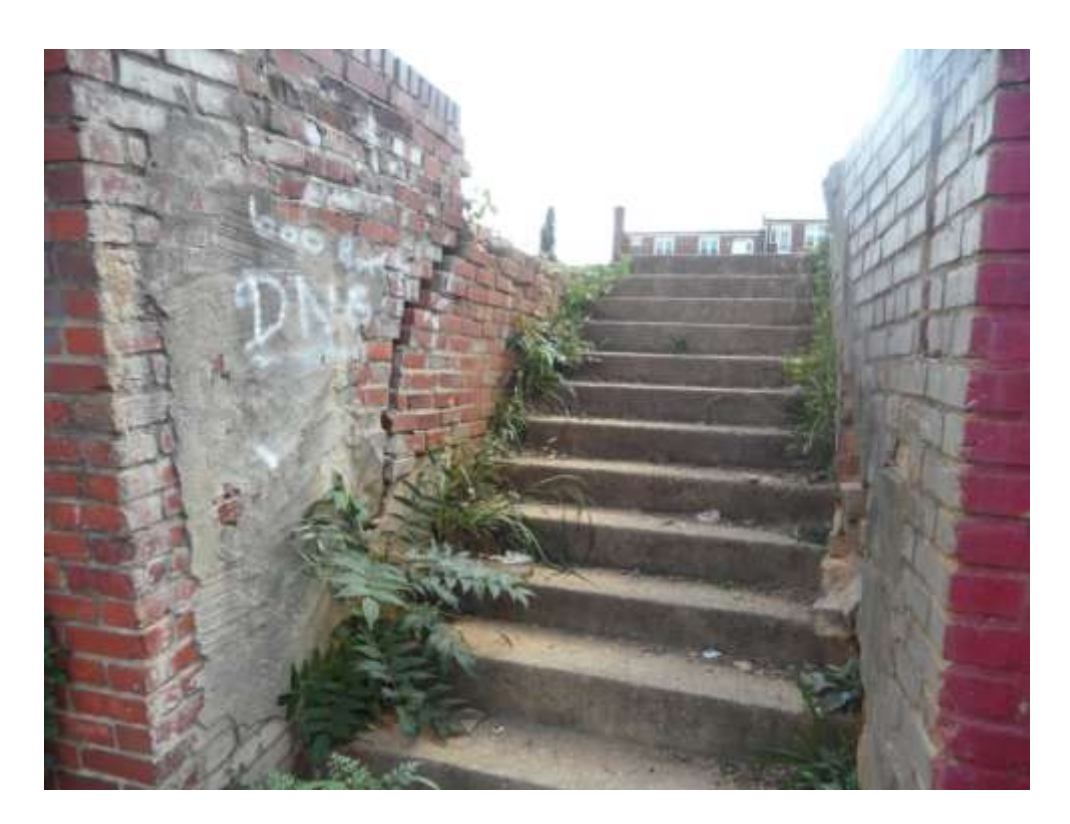
Stairs to 64 Forrester St from the Street