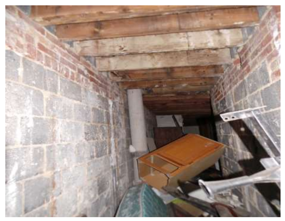
Storage in Hallway between Residential Units on the First Floor