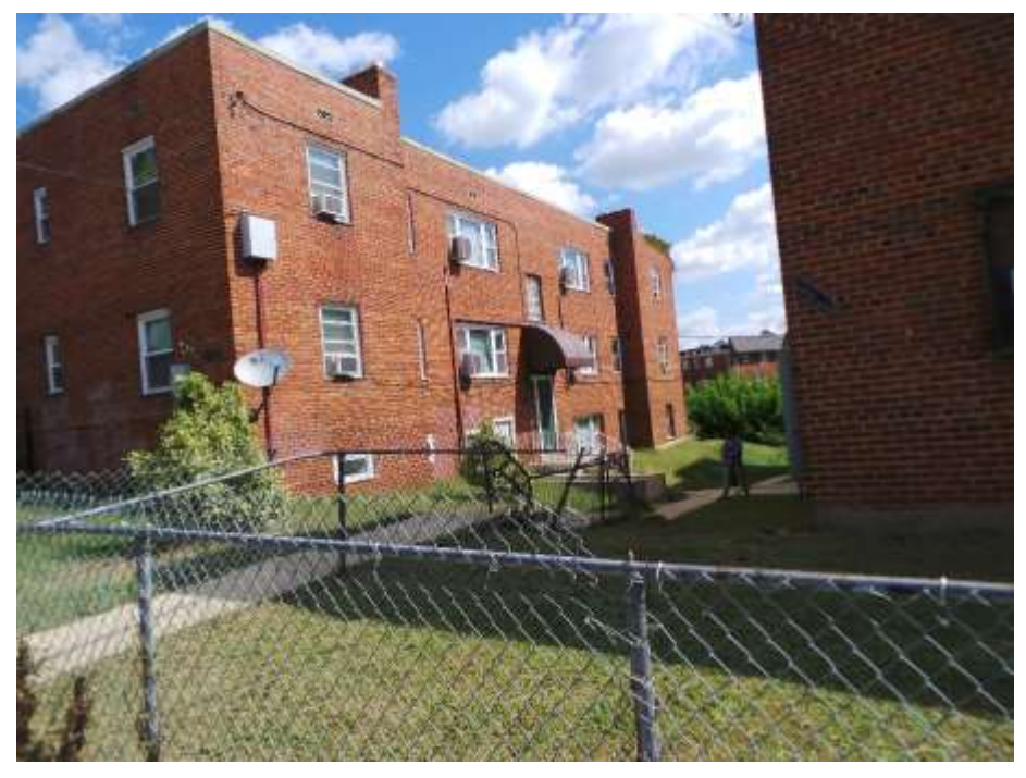
View of Adjacent Property at 4242 6<sup>th</sup> St, SE