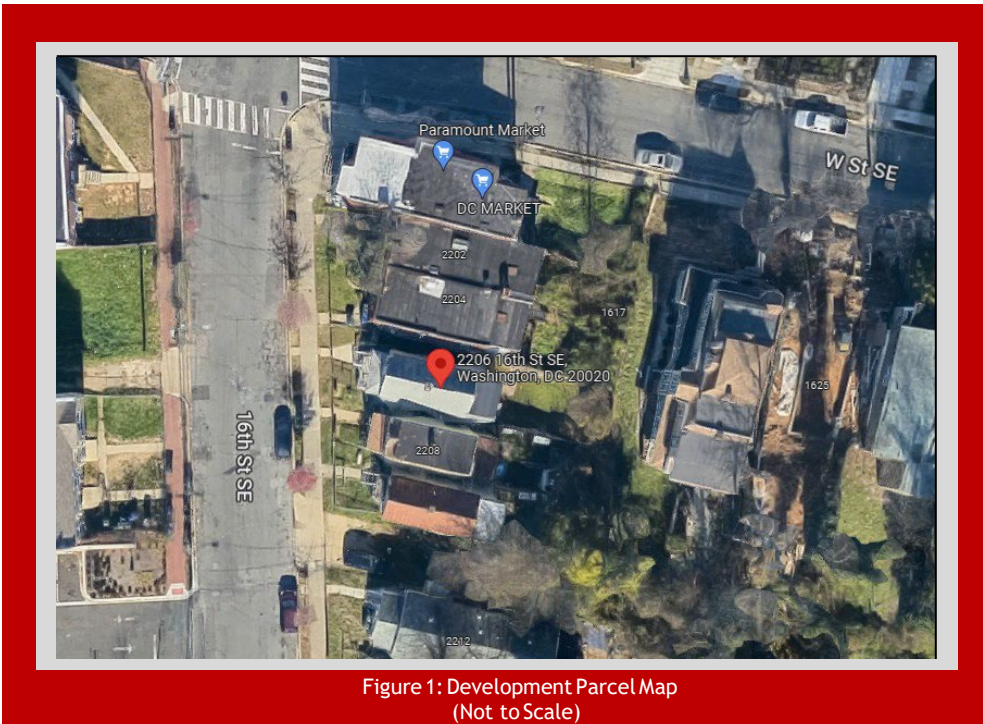
Figure 1: Development Parcel Map (Not to Scale)