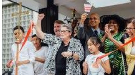
This video shares how we are helping residents by producing and preserving affordable housing, and revitalizing neighborhoods.