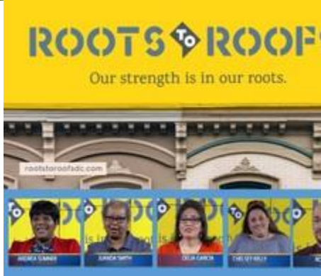
Five homeowners share how it is possible to purchase affordable housing in DC.