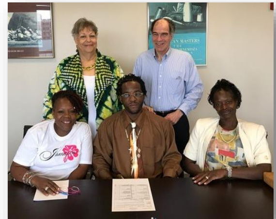
The tenants of the 22 Atlantic Street SE Association, seated, are among many who preserved their affordable housing through TOPA.