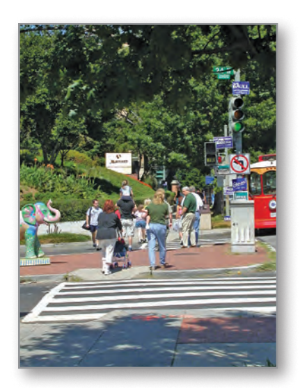
The area was one of the only parts of the city to experience an increase in population during the 1990s.