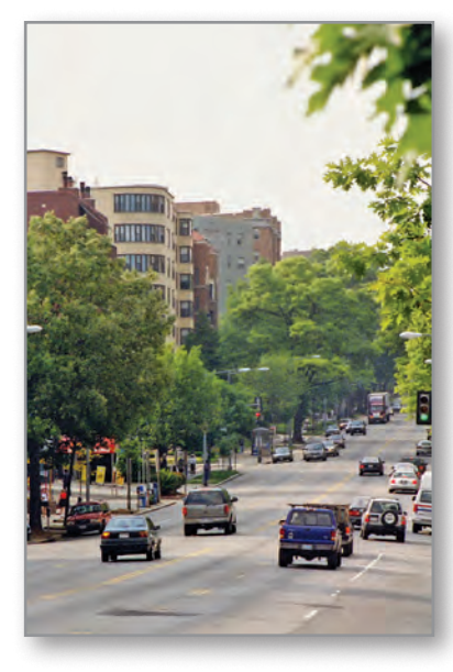
While there is support for development on underutilized sites along the major corridors, issues of height, scale, character, and density remain a source of concern as well as a source of debate within the community.