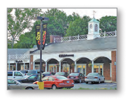
Spring Valley Shopping Center