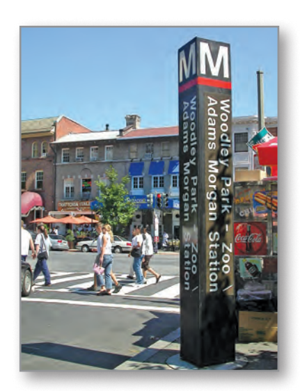
Woodley Park-Zoo/Adams Morgan is one of five Metrorail stations in Rock Creek West.

adjoining communities. Buffers should be adequate to protect existing residential areas from noise, odors, shadows, and other impacts. 2308.5