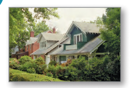
More than 30 percent of the housing units in Rock Creek West are single family detached homes—more than twice the citywide percentage.

The 2000 Census reported that 52 percent of the households in the Planning Area were homeowners and 47 percent were renters. This compares to citywide figures of 41 percent and 59 percent respectively. The percentage of homeowners in the Planning Area has been increasing; whereas renters outnumbered homeowners in 1990, the reverse was true by 2000. The percentage of vacant housing units in the Planning Area is low—standing at less than four percent in 2000 compared to a citywide average of almost 10 percent. 2304.2