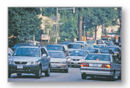
Ensure that land use decisions do not exacerbate congestion and parking problems in already congested areas such as the Friendship Heights, Tenleytown, and Connecticut/Van Ness Metro stations.

Please consult the Transportation Element of the Comprehensive Plan for policies on traffic levels of service and transportation demand management programs.