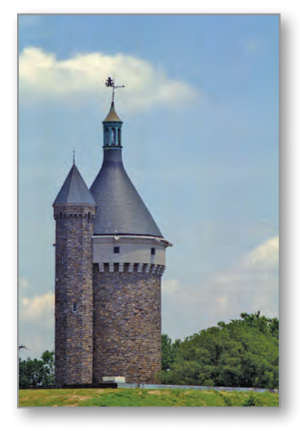
The Norman-style water tower at Fort Reno is located near Tenley Hill, highest point in the District of Columbia.