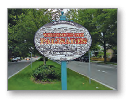
Palisades gateway signage on MacArthur Boulevard

Continue efforts to separate storm sewers and sanitary sewers within the area's stream valleys, with a priority on the combined sewer in Glover Archbold Park (conveying Foundry Branch). 2309,12