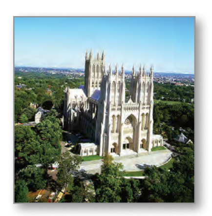
The National Cathedral is one of the best known cultural and visitor attractions west of Rock Creek Park.

Any future development adjacent to these areas must be designed to respect and maintain their parklike settings, and conserve their environmental quality. 2309.3